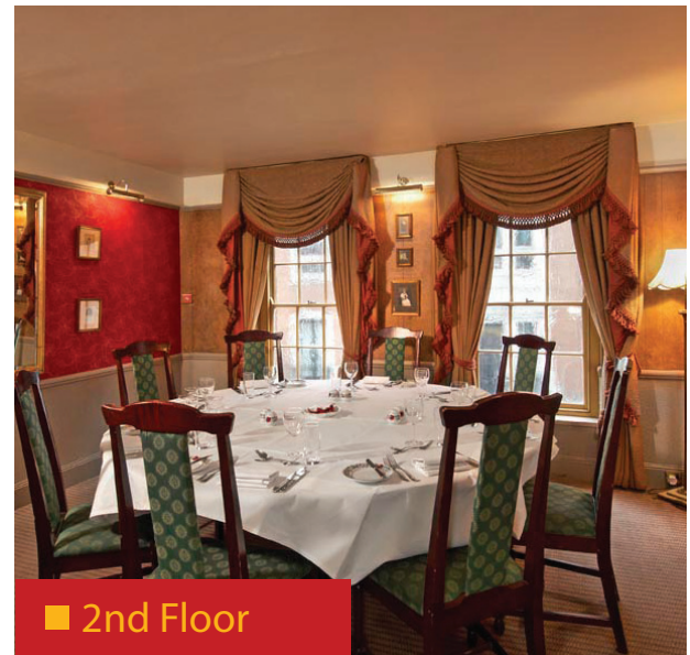
■ 2nd Floor