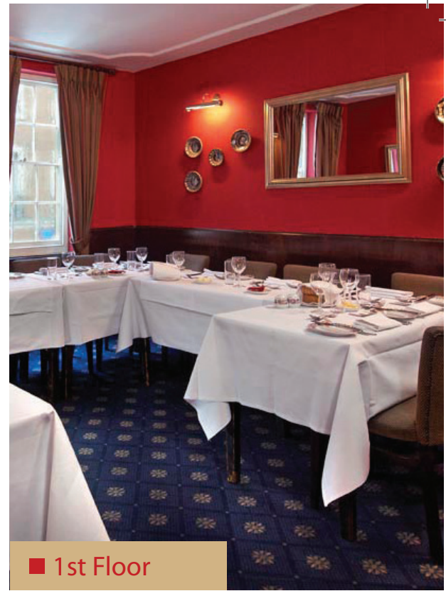
■ 1st Floor